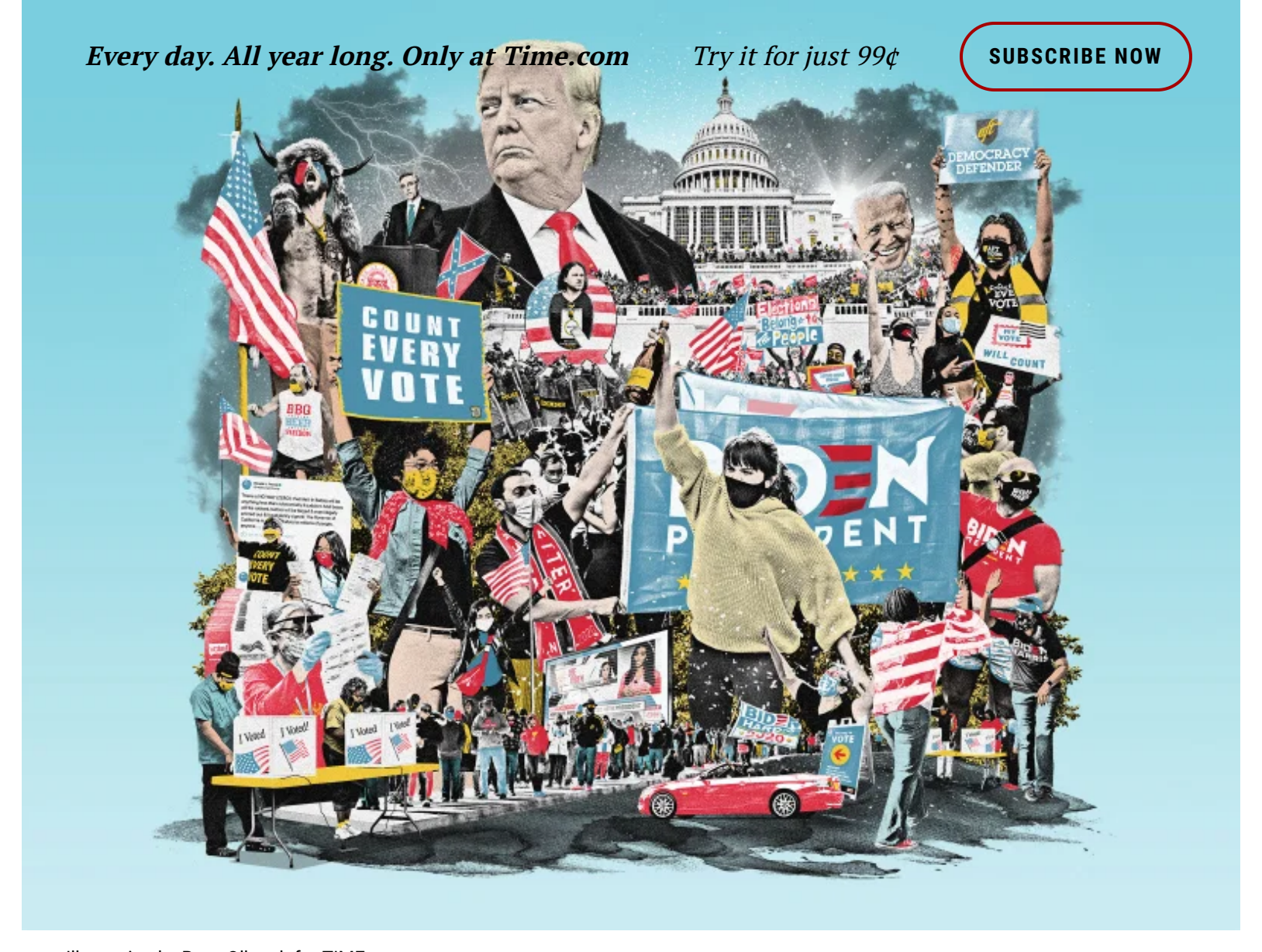
Illustration by Ryan Olbrysh for TIME